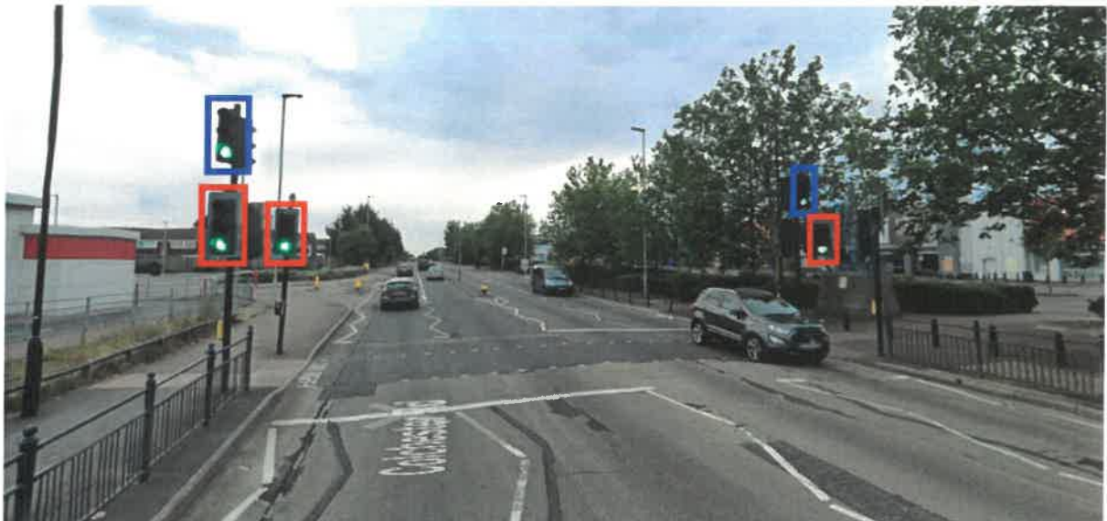
Photo 2: A12 Colchester Road pelican crossing looking north-east away from Gallows Corner (6m high signal heads highlighted blue; 4m high signal heads highlighted red).