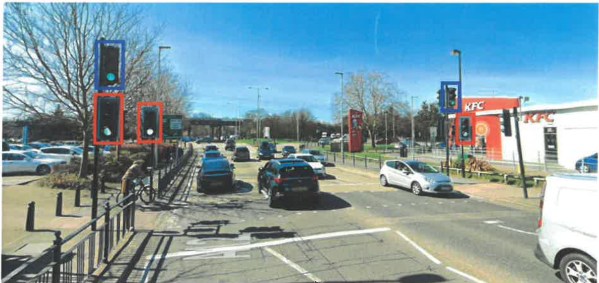
Photo 1: A12 Colchester Road pelican crossing looking south-west towards Gallows Corner (6m high signal heads highlighted blue; 4m high signal heads highlighted red). Photo source: Google Streetview April 2018.